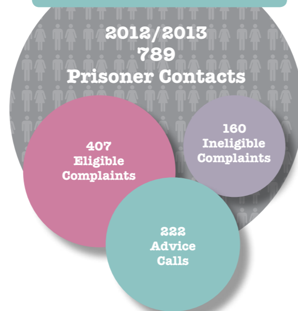
Figure 1. Prisoner Complaints